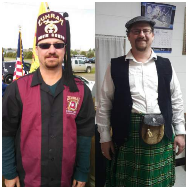
Zuhrah Shrine (Minneapolis) Drum Corps left; El Zagal Shrine (Fargo) Shrine Oilers Fez & Thistle (Bismarck) right

Lots of stories in between, but more articles yet to come...Thanks for listening.