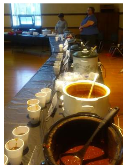
bless you all.