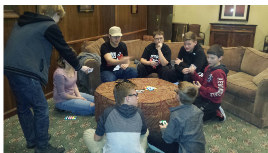
Fun night card games at the Scottish rite