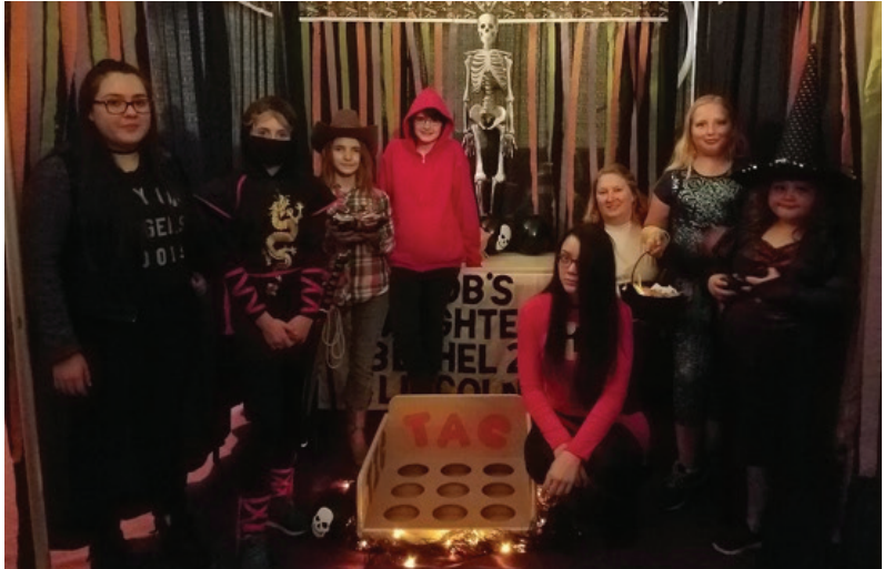
Bethel 27 with their booth at the Halloween Event at the Shrine Center.