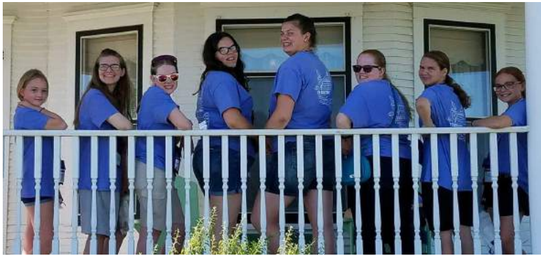
The girls posed on the porch of the beautiful old house that sits on the property of the Wessel Family History Farm where Fun Night took place.

The girls had a lot of fun this year and are already talking about Grand Session in 2018.