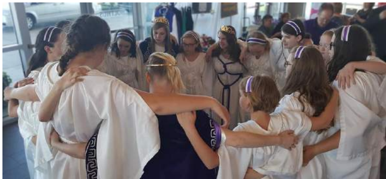
The two Bethels just before entering the room for their competition.

Eight girls from Bethel 5 and eight girls from Bethel 27 joined together this year for the Team Ritual competition and came home with 3rd place. How awesome is that!