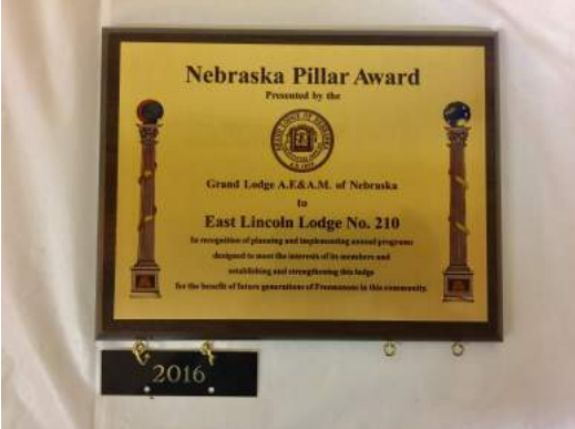
Left: The Pillar Award Plaque

East Lincoln Lodge 210 will be holding our centennial banquet on June 17th at 6:00 PM. Please contact WM Joel Green for more information!