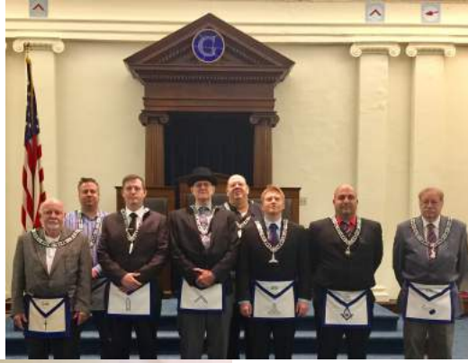
Right: East Lincoln 210's 2107 officers