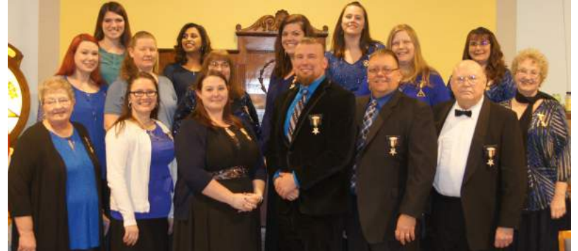
Greetings Masonic Family!

Happy April! It is good to be back writing articles consistently. A lot has happened since the beginning of the year so I am going to give you a recap of the events that occurred at Myrtle Chapter.