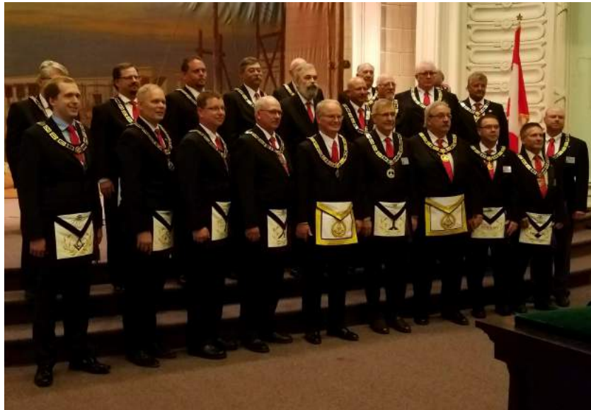
2018, at the Masonic Center in Grand Forks, North Dakota. This year, I represented my Dual Lodge, Mandan Lodge #8 in Mandan, ND, not only for the first year as Past Master, but also as my first year serving the Lodge as Lodge Secretary. I can't remember the Annual Communication rules in Nebraska or Minnesota, but North Dakota a Master or either Warden can represent the Lodge or have a proxy in their place; but a Lodge Secretary, as an important part of Lodge's business and communication with Grand Lodge is not allowed to have a Brother proxy for him.