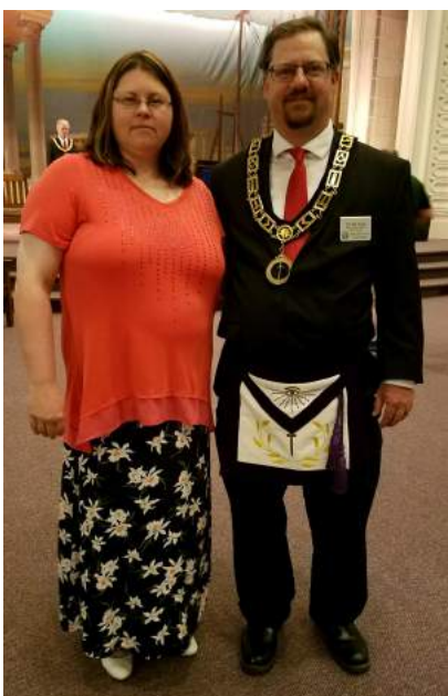
We had held our 129th Annual Communication of the Grand Lodge of North Dakota on June 14-16,

Why did I mention about the Tyler? Good question. But since I'm not sure of any Brother whose first name was “Master,” “Junior Warden,” “Senior Warden,” or any other Lodge officer title down the Line, I would think I have that privilege to stall some more. ;)