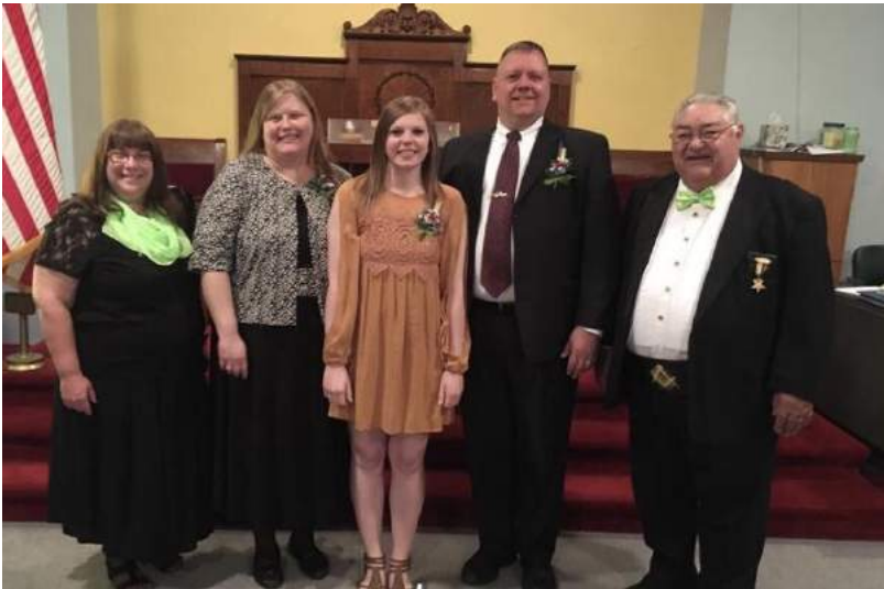
Greetings Masonic Family!

Getting to know your members: VIP Member of the Month!