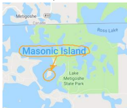
Masonic Island is in Lake Metigoshe State Park, Bottineau, ND. (Photo: Drawing over Google Maps)