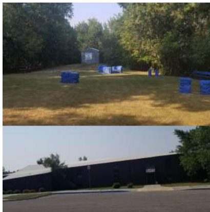
Masonic Lodge setting at Masonic Island (TOP); Masonic Auditorium at International Peace Gardens (BOTTOM).

Lots of stories in between, but more articles yet to come...Thanks for listening.