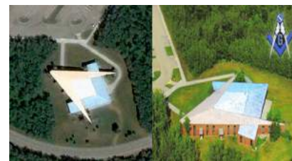
Masonic Auditorium is within the International Peace Gardens between Boissevain, Manitoba, Canada (Hwy 10), and Dunseith, North Dakota, United States of America (Hwy 281).