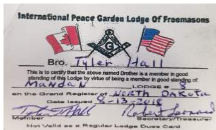
International Peace Garden Lodge of Freemasons membership card