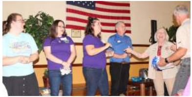
This luncheon was also a "Denim for Dogs" event

The day started with a luncheon at the Masonic Temple at 1635 L Street, with Electa Chapter #8 hosting. The Grand Officers and companions were treated to a Tail Gate Party (complete with a real tailgate and tents) consisting of traditional tailgate fare of hamburgers, meatballs, smokies, loose meat and pulled chicken provided by the Worthy Matrons of District V. Side dishes of salads, macaroni, and desserts were also served.