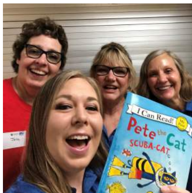
Officers read books to kids and made sure each kid got to take a book home.

Summer has been flying by fast and we've been working and having fun. Temple Chapter members started our summer by volunteering with United Way on their Day of Action.