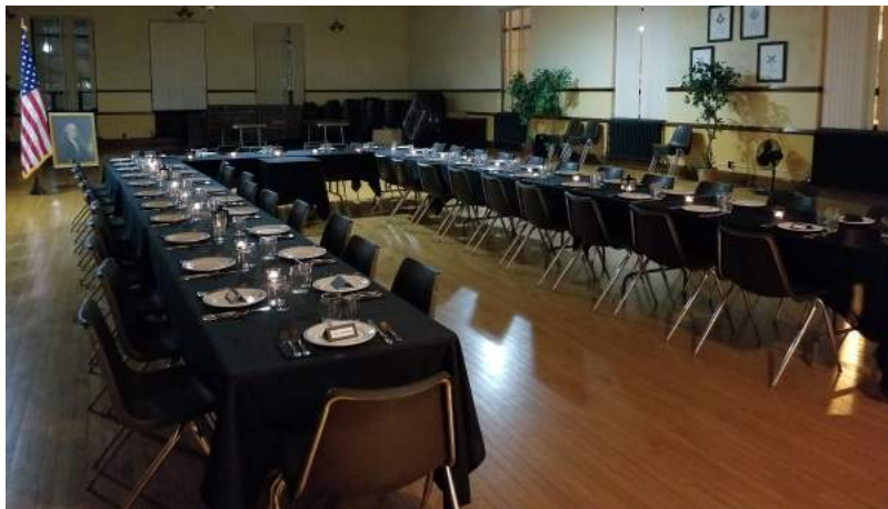
Table Lodge: A festive occasion of fellowship to celebrate our Craft. Thursday, February 21st, Liberty Lodge No. 300 hosted a Table Lodge on a scale we have not seen in years. Forty-five Brothers from several Lodges including Lancaster No. 54, Thistle No. 61, East Lincoln No. 220, Hickman No. 256, Cotner No. 297, Liberty No. 300, College View No. 320 and Bellevue No. 325 joined together for an evening of fellowship, reverence and celebration of Brother George Washington's Birthday.

Are you interested in some friendly Masonic competition? How is your Masonic trivia? Liberty Lodge is hosting a Masonic trivia night, Thursday, March 21st. Come join us from 6:15 – 7 for some pizza and from 7 to 8:30 for some Masonic trivia.