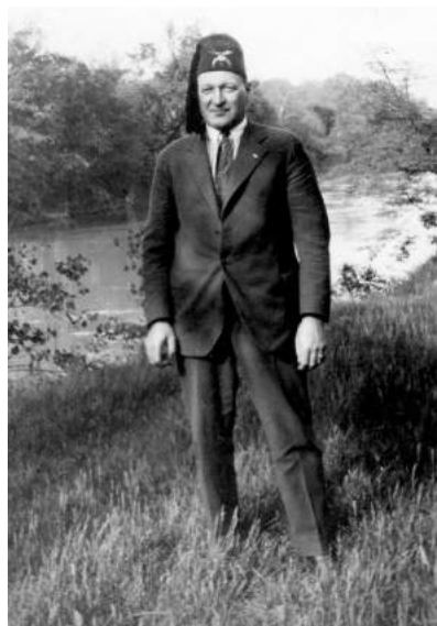
In the footsteps of my unknown mentor

When Masons from different lodges meet informally, a conversation centering on “Why did you join the Craft?” and “Were any others in your family Masons, too?” frequently ensues. In such cases, I say that my great grandfather is the only other Mason I know of among recent generations of my family, so it’s in recognition of him that I became interested in Masonry.