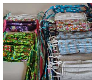
Individual masks being created to share with facilities and individuals.

care and first responder needs. You are our front line in the battle to conquer Covid-19. We are grateful for your abilities and devotion. We offer our gratitude and search for ways we can show our appreciation for your dedication to us. Pictured here is Deirdre Walsh, NICU nurse at Methodists Women's Hospital in Omaha. Deirdre is a member of Temple Chapter #271.