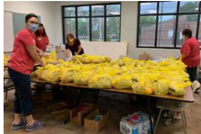
Volunteers from Mercy City Church prepare "We Can Do This" meal kits at the F Street Community Center to feed kids in the neighborhood.

Jul 10, 2020 Reprinted with permission from The Lincoln Journal Star