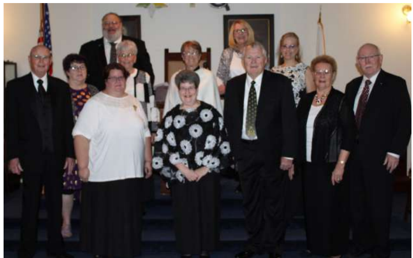
2020 Officers of Martha Washington Chapter #153

DUES ARE DUE Dues for all Nebraska Masonic Lodges for 2020 are due Jan. 1. Send payment to your Lodge Secretary. Members with unpaid dues are delinquent as of December 31. Suspension by Grand Lodge comes April 30. Suspension in Blue Lodge also means suspension in Eastern Star, York Rite, Scottish Rite and Shrine. Look at your dues card. If it does not say 2020, send payment today to your Secretary. Eastern Star dues are also due Jan. 1. Send dues to your Chapter Secretary. Unpaid members will become delinquent Oct. 1, with suspension Dec. 31.