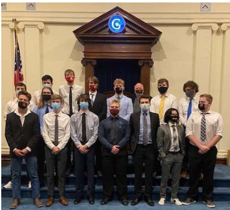
15 New Acacia Fraternity Initiates at East Lincoln 210 last week.