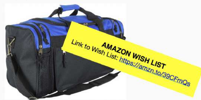
When new children arrive at the home, often they come with very little in the way of basic items such as toiletries, warm clothes and other items that they need to settle in to our community and feel welcome.