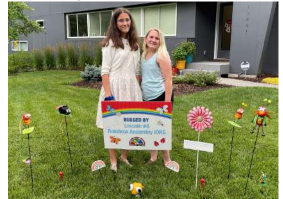
The girls "bugging" a friend