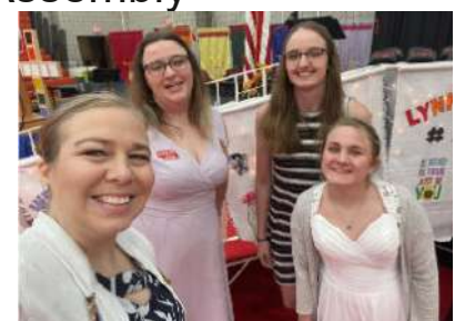
Lincoln Assembly 6 at Grand Assembly