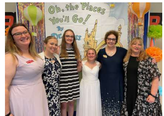
Lincoln Assembly 6 and board members at Grand Assembly