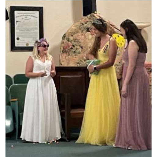
Having fun at Grand Visit