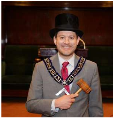
Worshipful Master of Lincoln Lodge No. 19