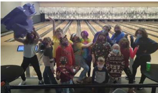
what a surprise! Look who showed up to spend time with Santa and Mrs. Claus.

The members of the Bethel had so much fun. But I think the Grinch had more fun. Hope he shows up again this year.