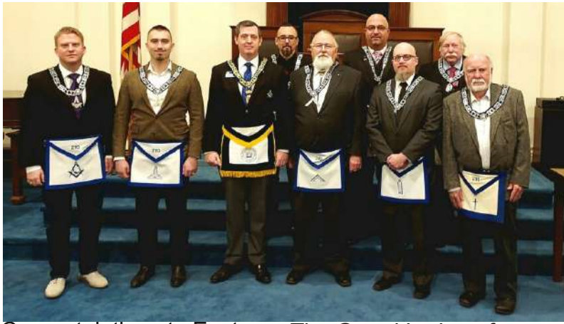
Congratulations to East Lincoln 210's newly elected officers for 2022: