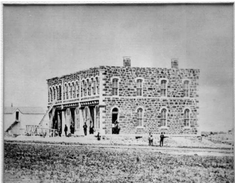
SWEET & BROCK BANK BUILDING 106 NO. 10 STREET.

Needless to say the Lodge has continued to prosper for over 150 years. There have been ups and downs. From 1919 to 1928 we had a total of almost 1,200 members. I am glad that I was not secretary during those years! That is a large number of men to keep track of. Currently we have 110 on the rolls. These men came from all walks of life, from one who once ran for president of the United States to truck drivers to journeymen. It is indeed a number to keep