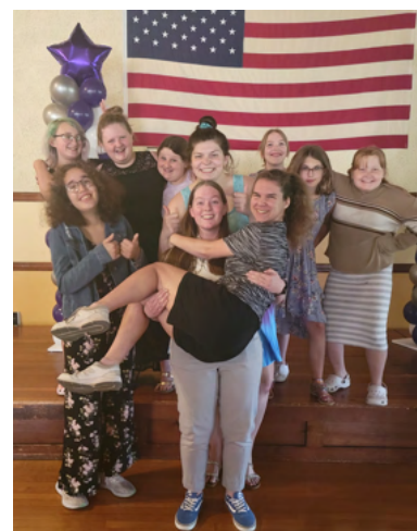
June 15-18 Bethel #5 will be heading to Grand