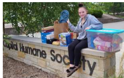
Capital Humane Society Donations

Bethel 5 held a "Meal Deal" Fundraiser on July 22 at the Super Saver on 56th & Hwy 2. We sold pulled pork sandwiches, hot dogs, and brats plus chips and a drink for only $3! Money raised goes to our operating costs for our Bethel and donations/tips goes to the HIKE Fund Inc. We had an amazing turnout! Our last "Meal Deal" fundraiser of the year was held on August 5th at the Super Saver at 27th & Cornhusker. We sold hot dogs and brats plus chips and drink for $3! Money raised from this fundraiser is donated to the Honored Queen's term project, The Foster Care Closet of Lincoln!