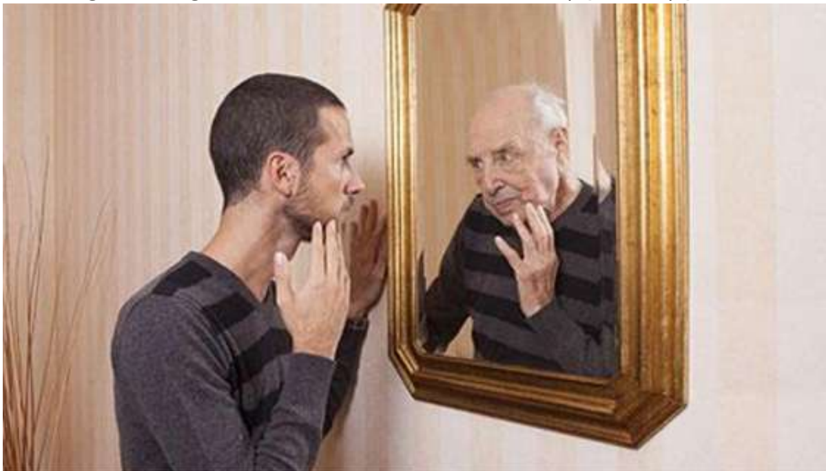
Let Freemasonry grow!

Please feel free to visit Liberty Lodge, on the first Thursday of the month as we continue to bring great times and fellowship to Masonry!!! 1635 L St, Lincoln NE