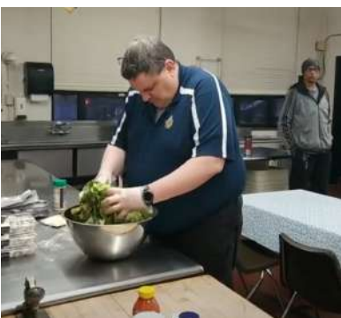
Excitingly, we are happy