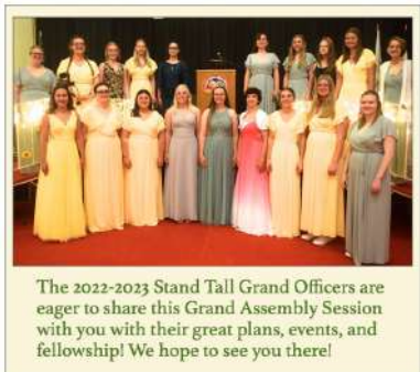
The 2022-2023 Stand Tall Grand Officers are eager to share this Grand Assembly Session with you with their great plans, events, and fellowship! We hope to see you there!

As you are making your summer travel plans and selecting where you will go and what you will do I extend a special invitation for you to visit the STAND TALL 2023 Session of Nebraska Grand Assembly of the International Order of Rainbow for Girls. Grand Assembly will be Friday June 9 - Sunday June 11 in the Marriott Riverfront Hotel and Marriott Center in South Sioux City, Nebraska.