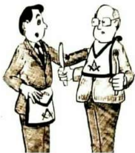
“DON’T GET ME WRONG BROTHER. I’M GLAD YOU’RE HERE. JUST TRY NOT TO BE SO OBVIOUS AS TO WHY YOU ARE HERE”