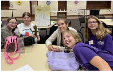
Grand Officers Retreat

On September 7th, five members and three adult volunteers attended the State Officers and Grand Committee Retreat held at the Sesostris Shrine in Lincoln. Those in attendance learned more about their positions for the grand year, had fun with members from across the state and enjoyed delicious snacks!