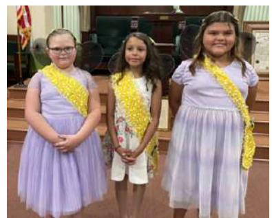
Bethel Meeting & Jobie-to-Bee Ceremony

On September 7th, five members and three adult volunteers attended the State Officers and Grand Committee Retreat held at the Sesostris Shrine in Lincoln. Those in attendance learned more about their positions for the grand year, had fun with members from across the state and enjoyed delicious snacks!