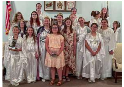
Bethel 1 Installation

On August 19, several of our daughters and a few adults attended a state online retreat with members from all across the state of Nebraska. We learned a lot about the grand projects and went into breakout groups to learn more about our state offices for the year.