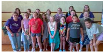
State Officers & Grand Committees Virtual Retreat

On August 12, the members of Bethel 5 gathered early in the morning for breakfast, trivia and a Jobie Boot Camp where we worked on floor work, ritual work, how to make a motion, setting up a Bethel room, music, and so much more!