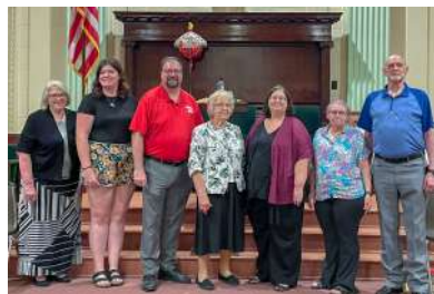
Bethel 5 "Luau Under the Stars" Grand Visitation