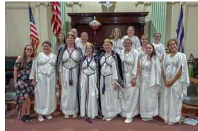
Bethel Meeting & Council Installation

On September 8, eight daughters and four adults had the honor of serving the members of the Naphis Temple Daughters of the Nile at their banquet at Sesostris Shrine Center. It was great being asked as none of the eight members have ever served a dinner before. We all learned a lot of serving etiquette and had a lot of fun doing it.