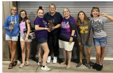
Baked Potato Bar Fundraiser & Silent Auction

On August 27, Bethel 5 held their first Baked Potato Bar Fundraiser. Those in attendance were served yummy potatoes with lots of toppings to choose from, a side salad, and a delicious assortment of homemade desserts for a donation! We also held a silent auction where guests were able to bid on round wooden door signs that were designed and made by our very own members!