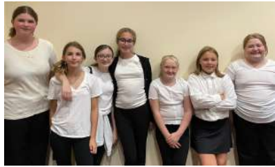
Jobie Boot Camp

On August 12, the members of Bethel 5 gathered early in the morning for breakfast, trivia and a Jobie Boot Camp where we worked on floor work, ritual work, how to make a motion, setting up a Bethel room, music, and so much more!